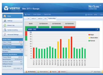
Individual circuit breaker readings show current for each circuit breaker in relation to predefined threshold levels.

Power consumption mapping can also be used to display each site rack's power performance characteristics. Discovering when and where power is consumed helps operators identify site load distribution inefficiencies. Since power to servers typically relate to heat dissipation, power consumption data is a good indicator of site hotspots. This can be used to adjust cabinet loads or placements to obtain optimal site cooling efficiency. Understanding power distribution on site is the first step to a cost effective energy savings plan.