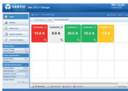
Power consumption map showing aggregated power for each customer on shared/hosted co-location sites.