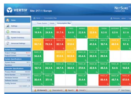
Power consumption map showing load (amps), status and position on the floor plan of all connected DC equipment.